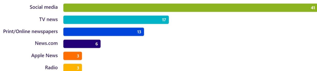
Figure 3: Types of media consumed (frequency of response)

The most frequent form of traditional media consumed was television news—most commonly the ABC, followed by news on commercial channels (7, 9 or 10), SBS or Sky news. The next most frequent form of traditional media consumed was online or print newspapers or online political commentary (such as the Guardian or the Conversation), followed by online news services or applications, such as News.com, AppleNews or NineMSN. Only three individuals listened to radio news, usually in the car. xii